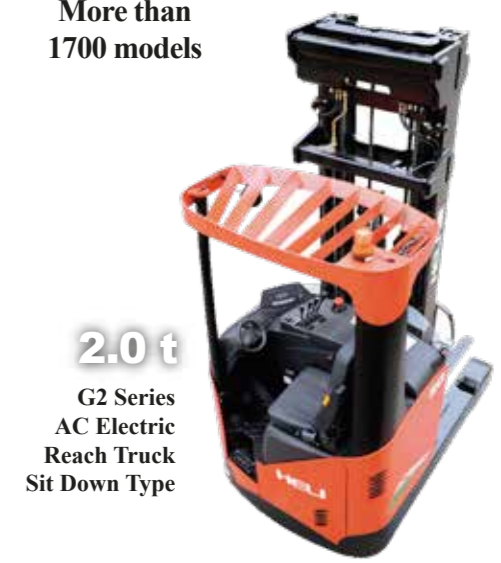
2.0 t G2 Series AC Electric Reach Truck Sit Down Type