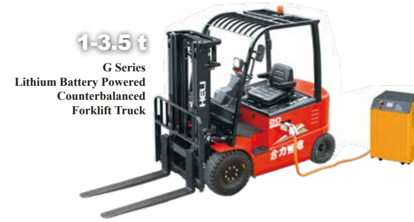
1-3.5 t G Series Lithium Battery Powered Counterbalanced Forklift Truck