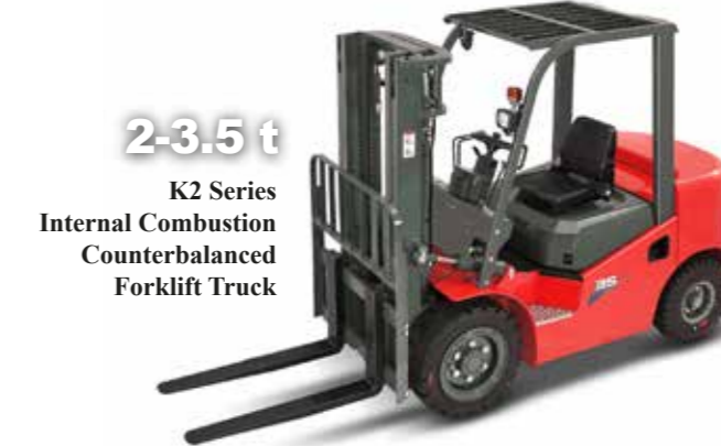
2-3.5 t K2 Series Internal Combustion Counterbalanced Forklift Truck