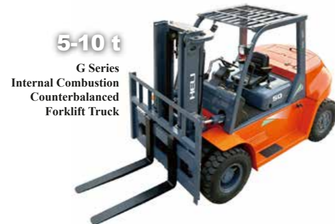
5-10 t G Series Internal Combustion Counterbalanced Forklift Truck